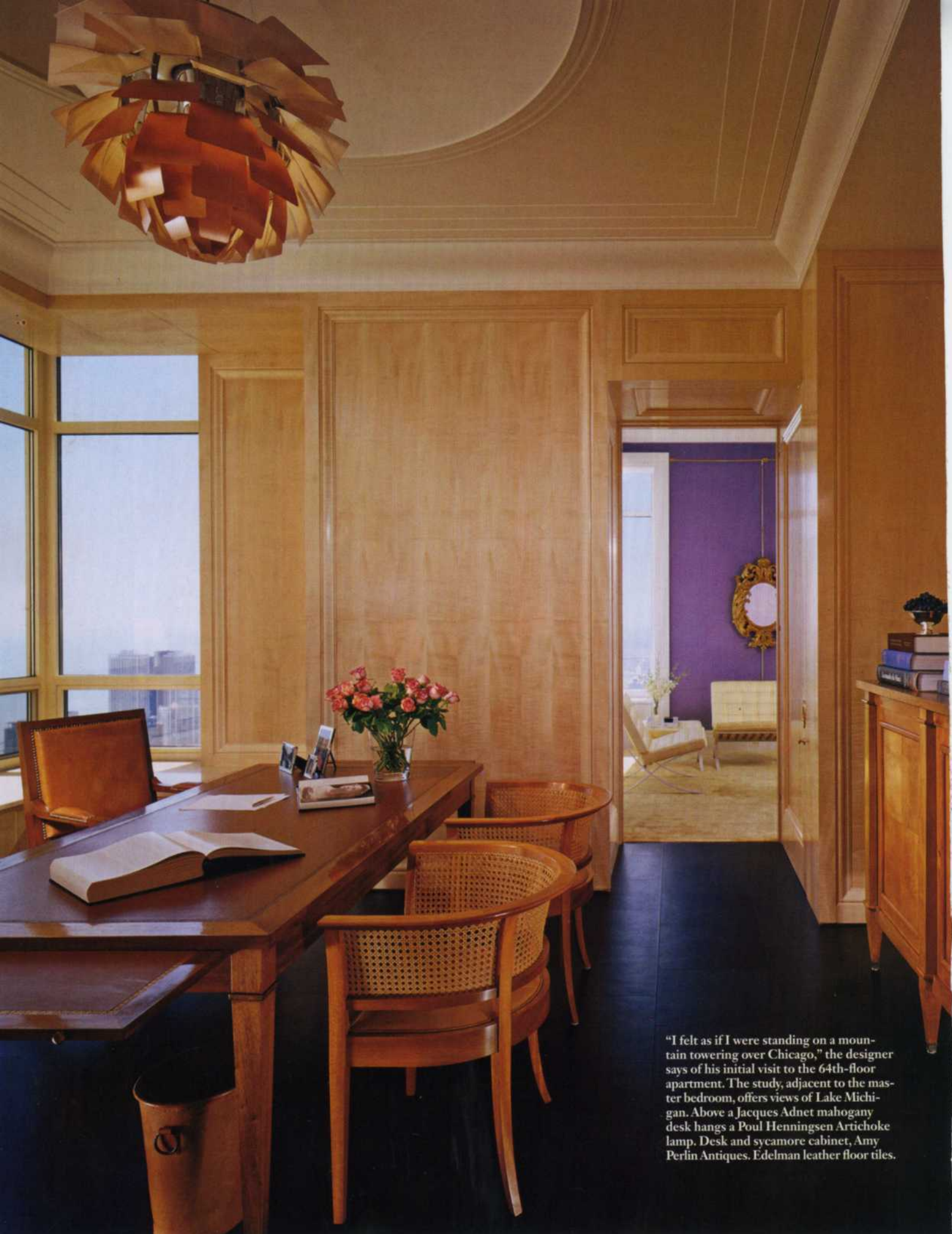
"I felt as if I were standing on a mountain towering over Chicago," the designer says of his initial visit to the 64th-floor apartment. The study, adjacent to the master bedroom, offers views of Lake Michigan. Above a Jacques Adnet mahogany desk hangs a Poul Henningsen Artichoke lamp. Desk and sycamore cabinet, Amy Perlin Antiques. Edelman leather floor tiles.